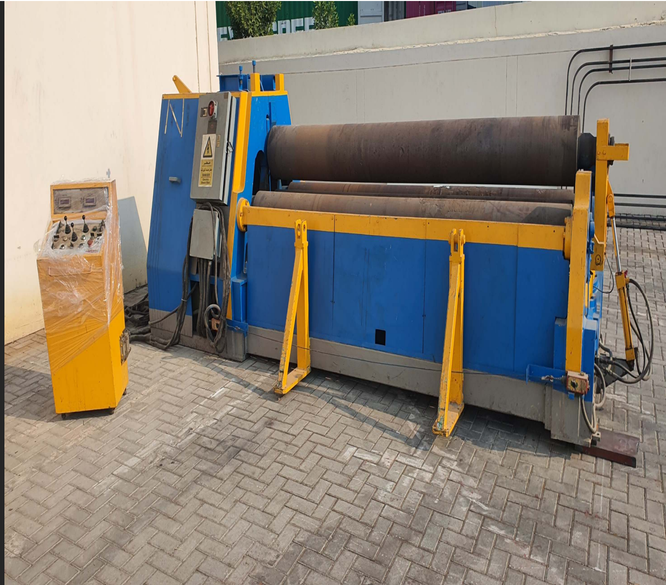
PLATE ROLLING MACHINE